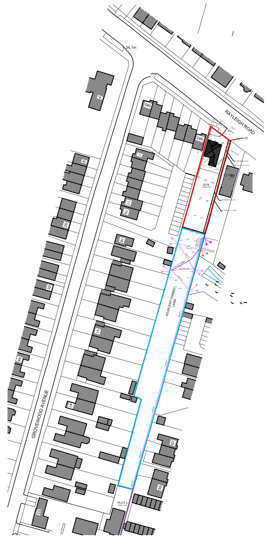
PROPOSED LOCATION PLAN Scale 1:1250